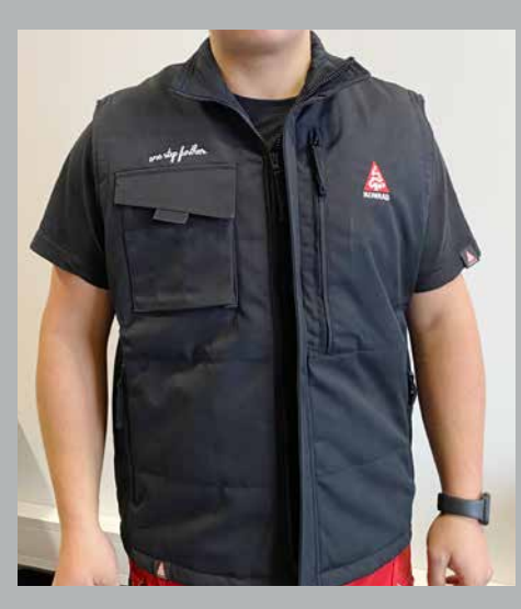
Gilet in black